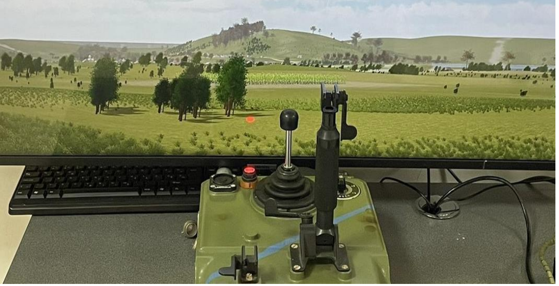
Guidance panel 9S415 positioned in front of panoramic battlefield view